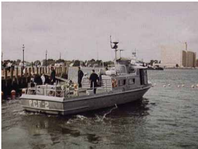
R/V Matthew Maury of Tidewater Community College gets a new paint job. Was PCF-2, now R/V Matthew F. Maury, Norfolk, VA