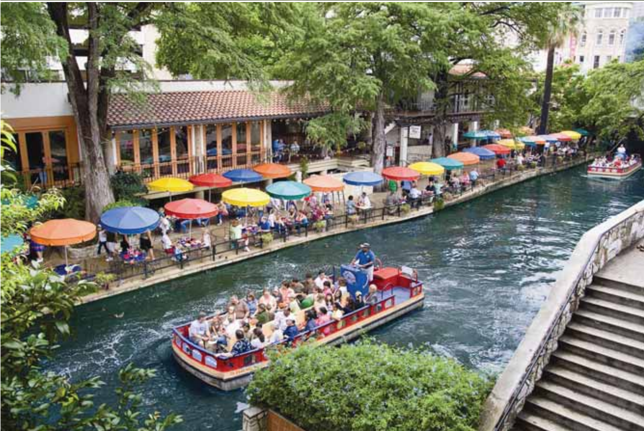
Alamo A Piece of History